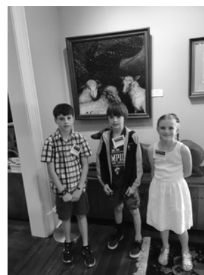
3rd graders who won the 'Lead the Parade' contest touring the museum before the parade