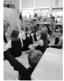
Our Education Team with 3rd Graders