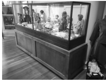
Doll Storage Case built by Perry Clark