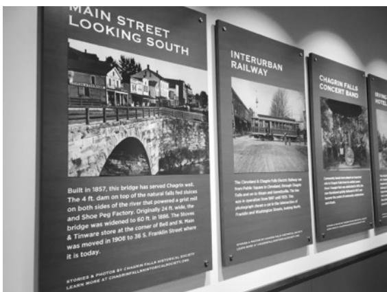
The new Heinen's in Chagrin worked with the Historical Society to create these panels that are by the checkout counter