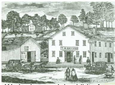
We had a special exhibit of Chagrin artists in the Bo Burr Community Room and Gallery