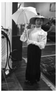
Violet dressed for the 1890s