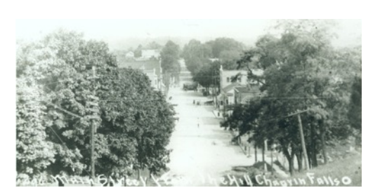
Grove Hill 1897