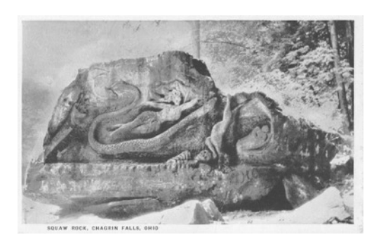
Squaw Rock 1890