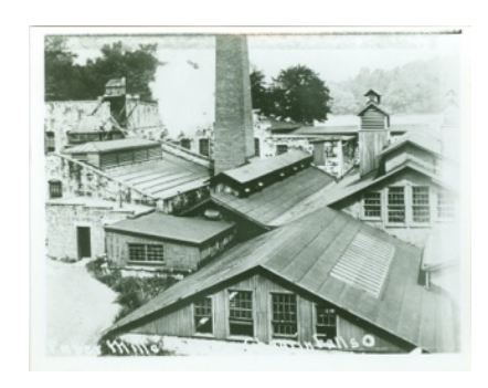
Adams Bag 1895