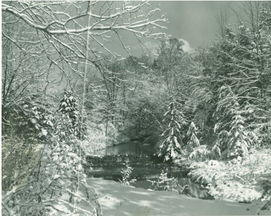
Fish Hatchery looking east