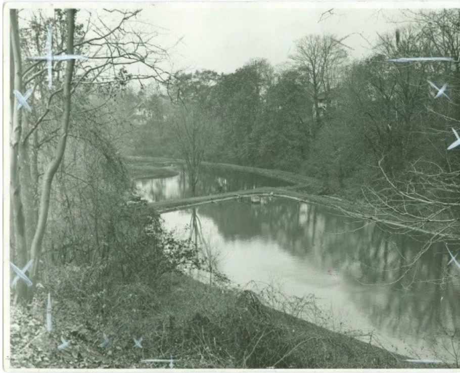
Fish Hatchery looking northwest. 286 Bell Street home is in the background