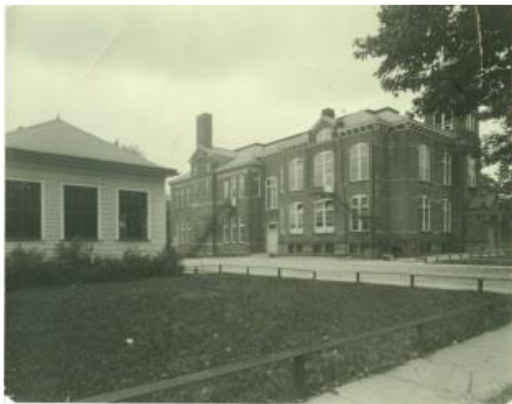
1909 1 st , 2 nd grade addition (Left of 1885 School Building) on Philomethian Street