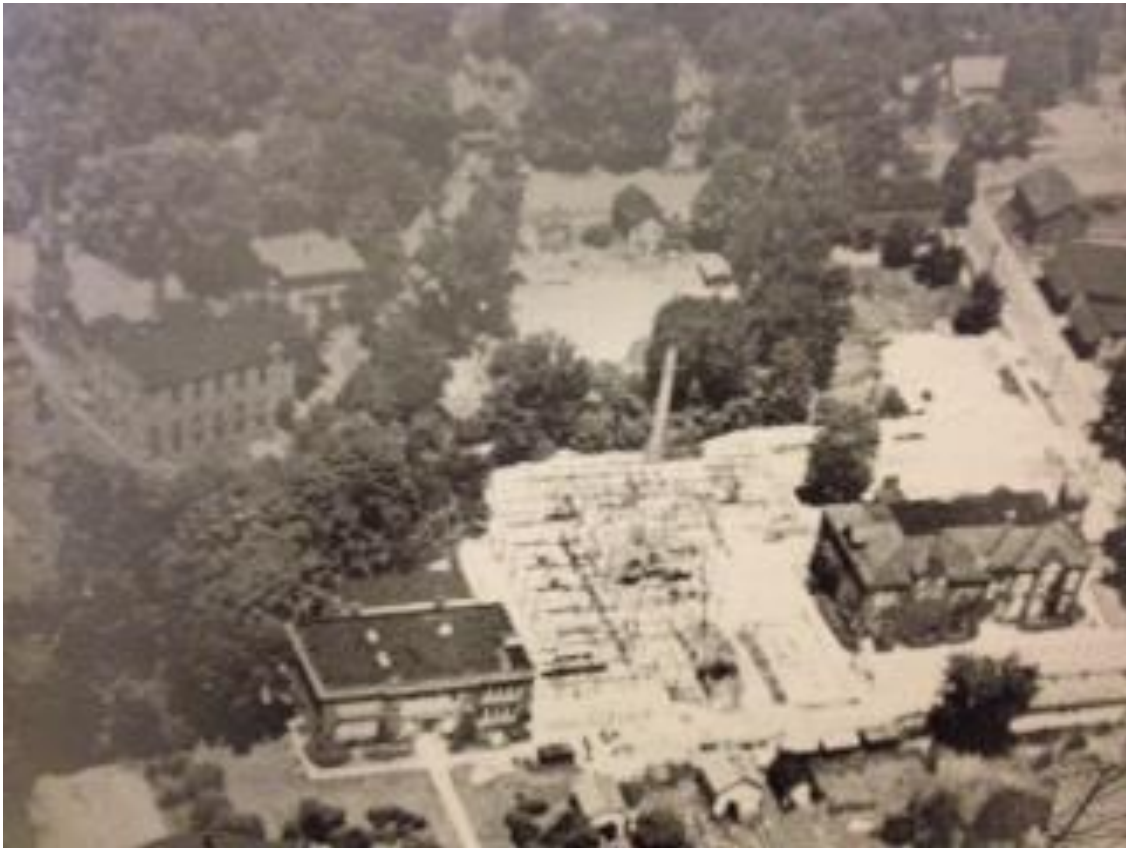
1940 Addition Construction