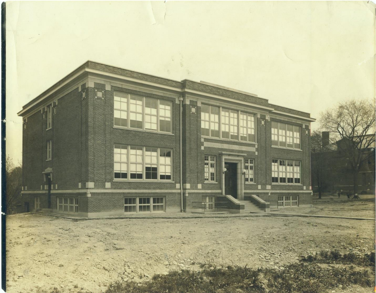
1914 High School facing Washington Street. 1885 Union School Building is on the right

In 1914 a new High school was added to the Philomethian campus. This building celebrated its 100 th anniversary in 2014 and is still in use today. In 1940, a large addition was built that consisted of space for an elementary school, library, auditorium, gymnasium, cafeteria and industrial arts wing. When completed, the 1885 brick school was torn down as well as the wood frame 1 st and 2 nd building. The wood cafeteria and home economics building was sold for scrap in 1946. A third floor was added above the cafeteria in 1952. The library was expanded in 1971. Renovations to the building were done in 1972. Major renovations occurred in 1989. This school was renamed the Chagrin Falls Intermediate School in 1999 and now houses 4 th and 5 th grades. At that time additional renovations occurred. The boilers were replaced in 2003.