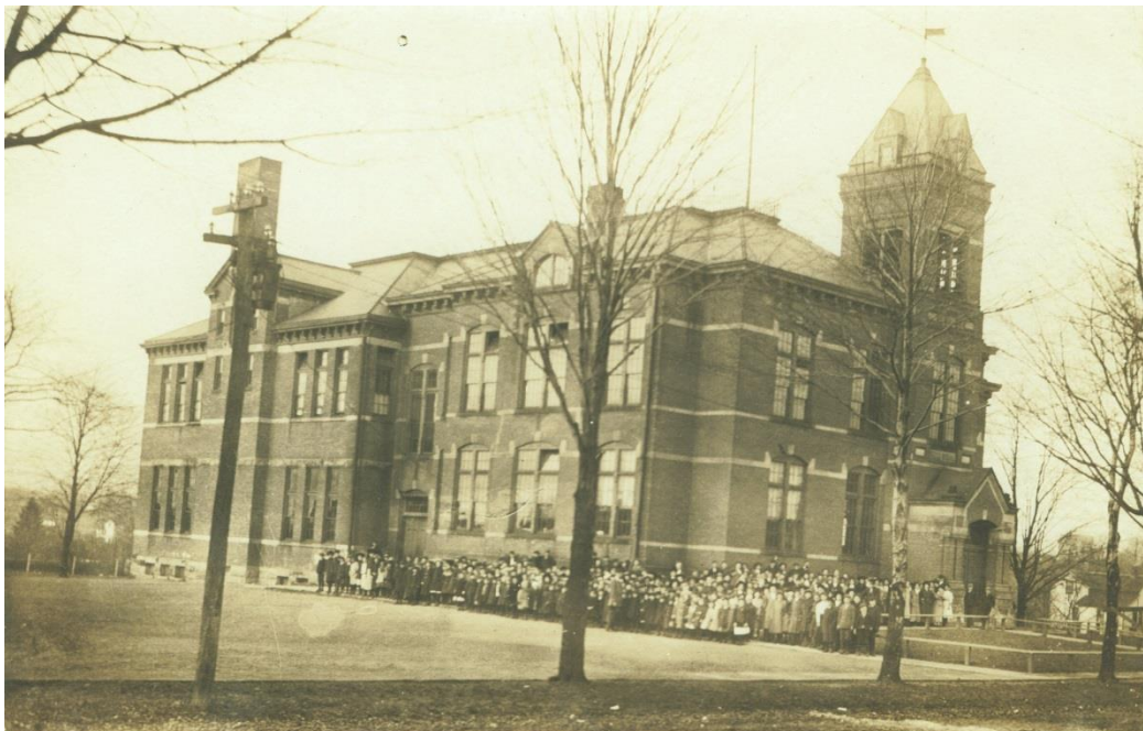
1885 School Building.