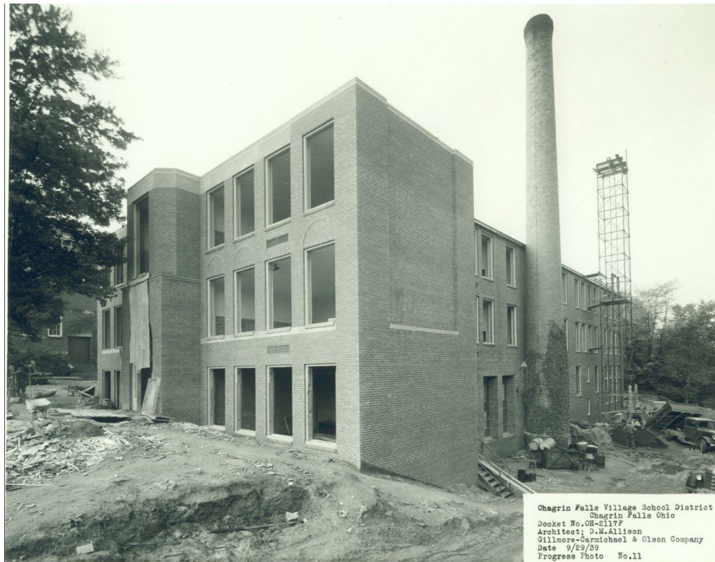
1940 Addition Construction