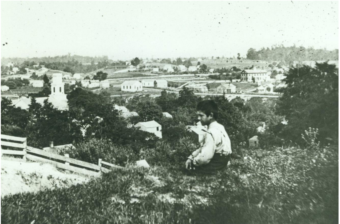
View looking Southwest from Grove Hill. Asbury Seminary in back right of picture