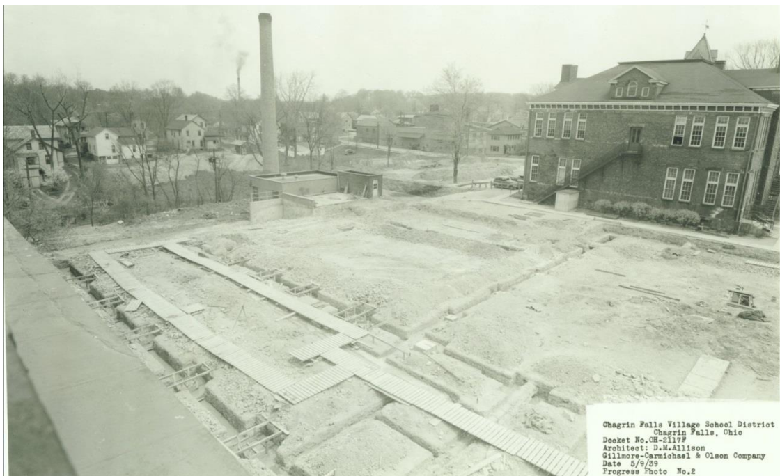
1940 Addition Construction