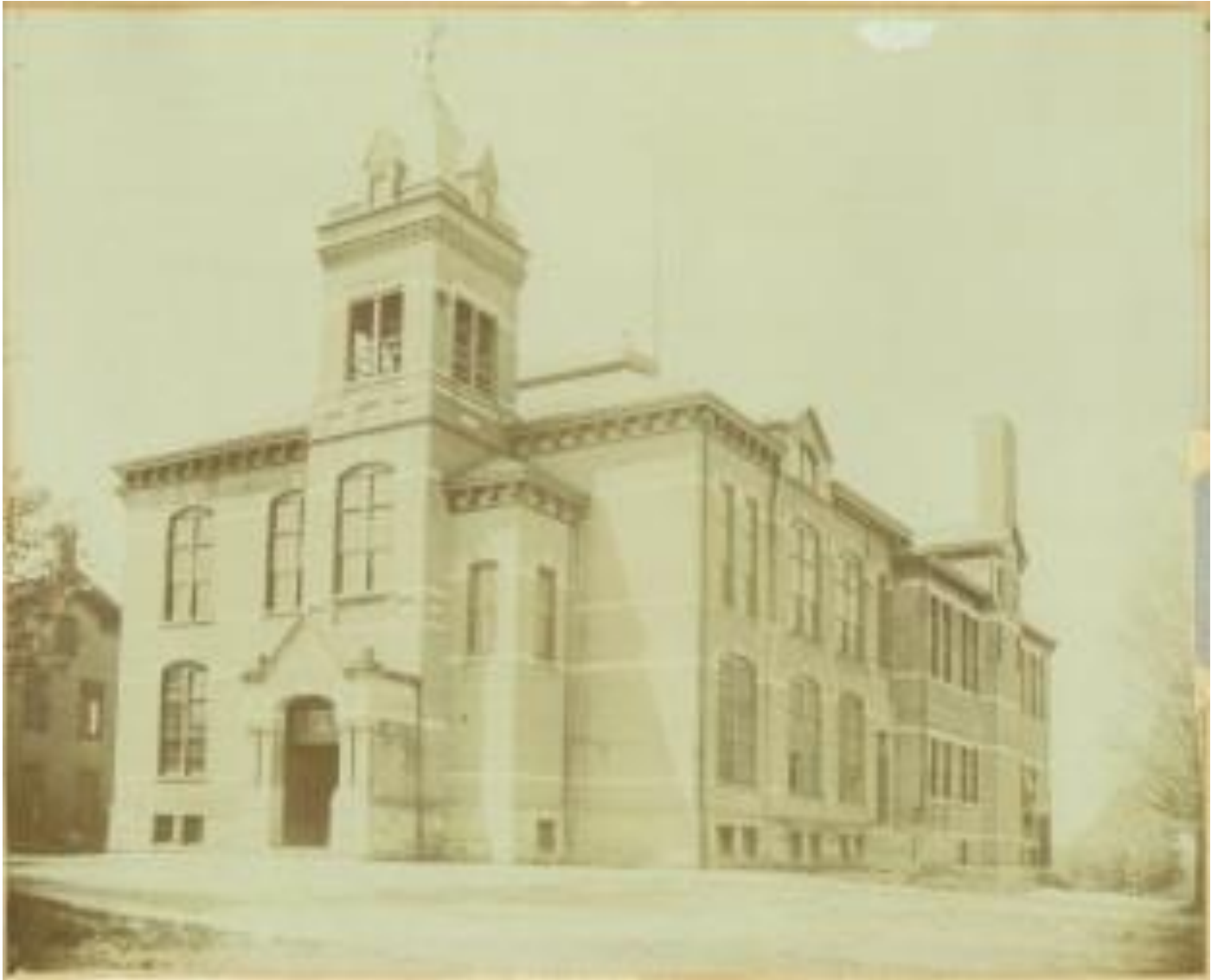
1885 School Building, (Asbury Seminary can be seen lower left corner) on Philomethian Street

In 1885 a new school building was built on Philomethian, just north of the Asbury Seminary. It was located where the eastern parking lot is now at the existing school on Philomethian is located. The school was known as the Union School. This school housed K-12 grades. It remained on this site until torn down in 1940. A 750 seat auditorium and additional class rooms were built in 1892. In 1909, a separate wood frame two classroom building was constructed for 1 st and 2 nd grades. A gymnasium was added to this school in 1923 for use by the new 1914 high school building on the same campus. In 1930 a separate wood frame cafeteria and home economics building was built on the north side of the Philomethian campus near Federated Church.