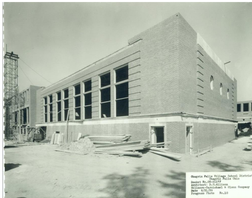
1940 Addition Construction