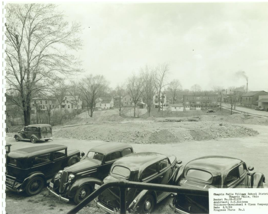
1940 Addition Construction