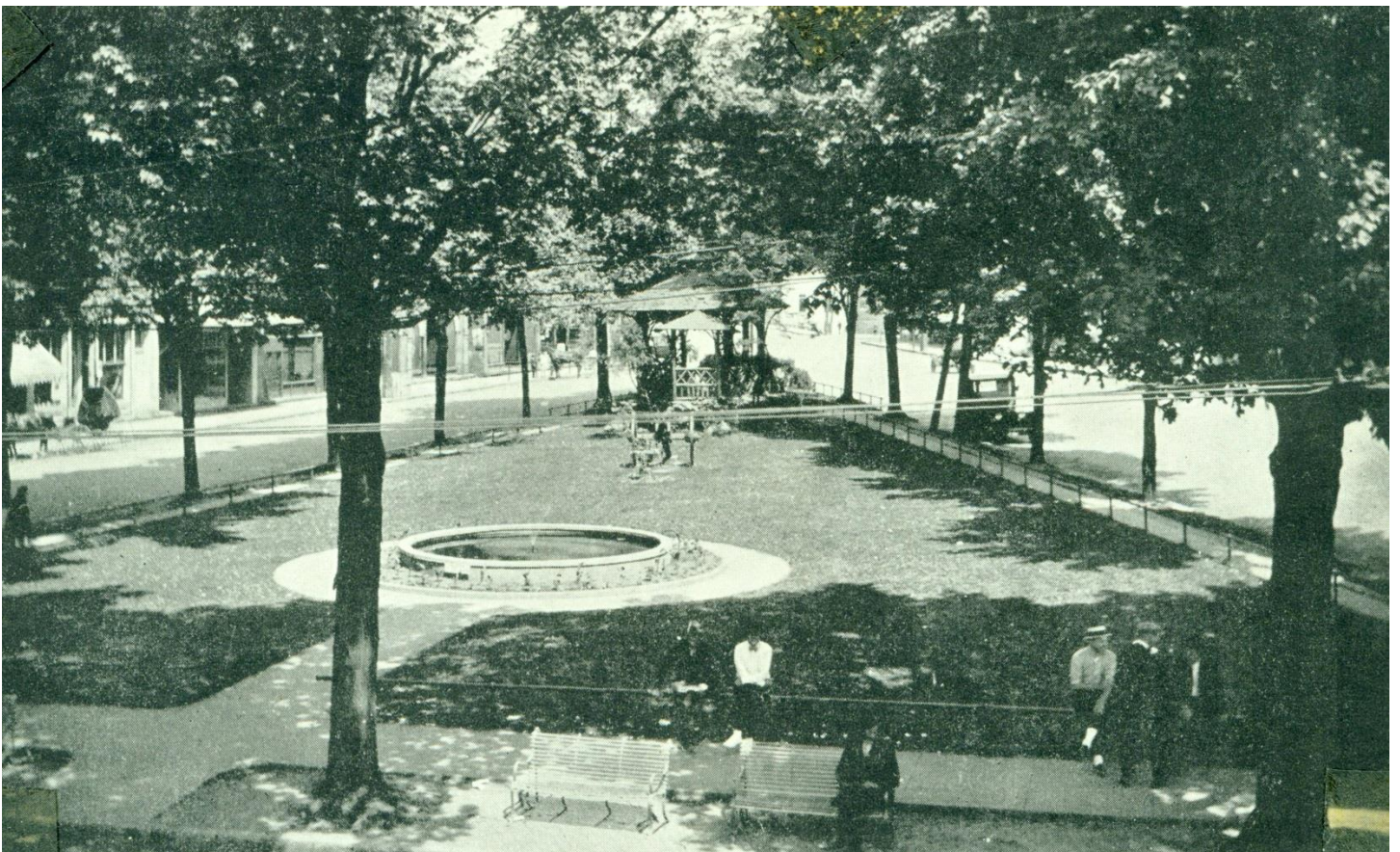
Triangle Park – circa 1920