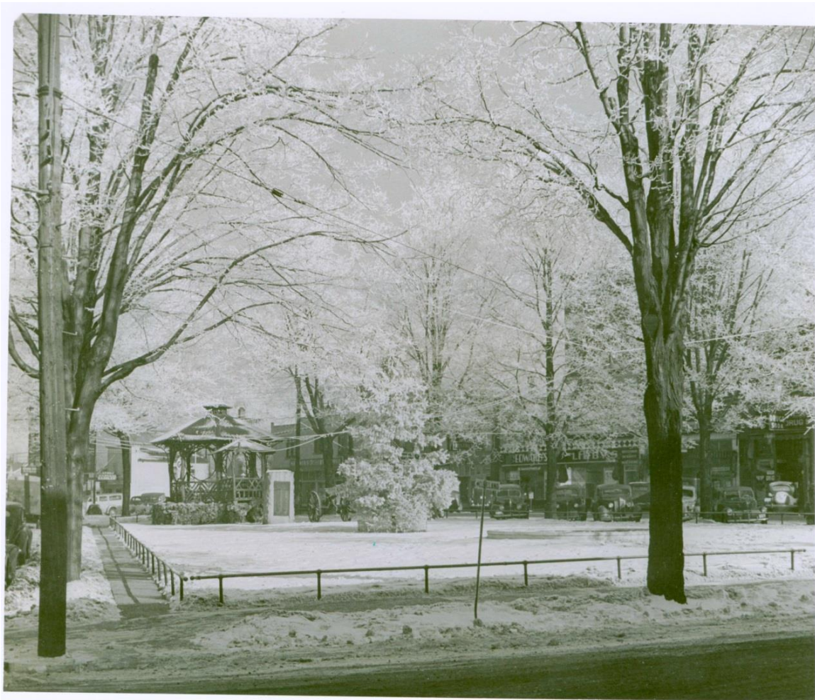
Triangle Park 1939