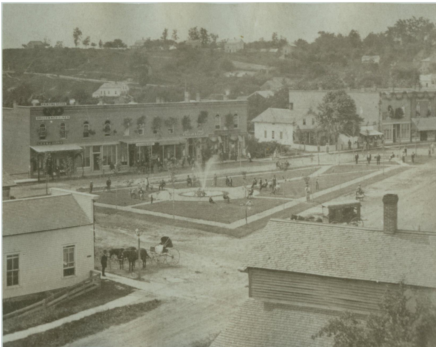
Triangle Park in 1875.