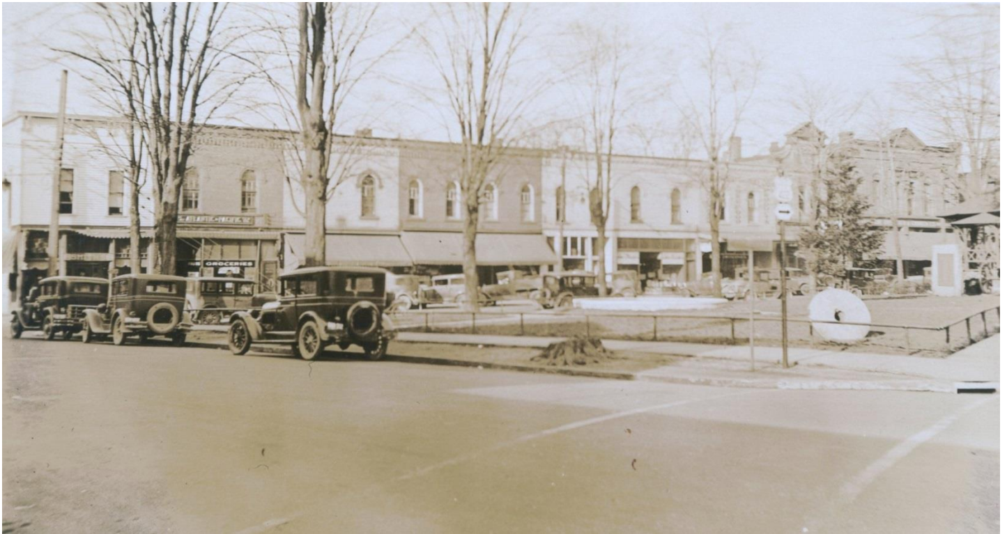
Triangle Park 1927