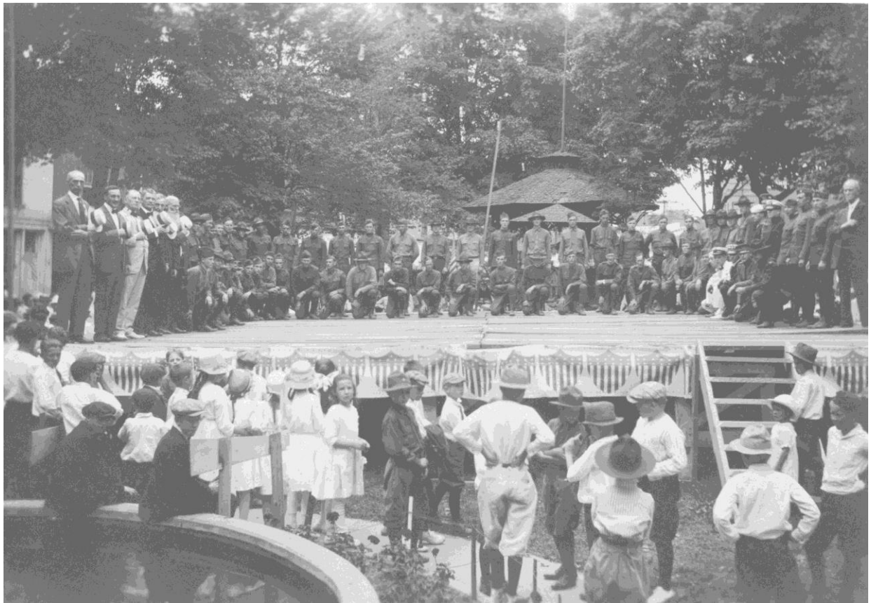
Triangle Park at end of WWI - 1919