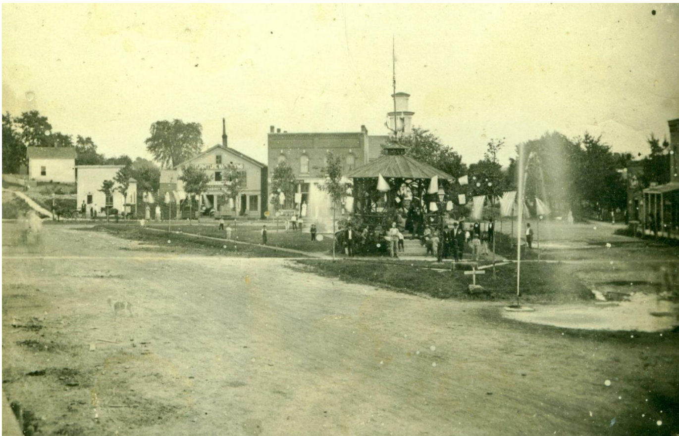
Triangle Park 1877. Notice Buckeye Carriage works in background on left middle. Fountain just left of bandstand. The fountain on right was for horse trough.