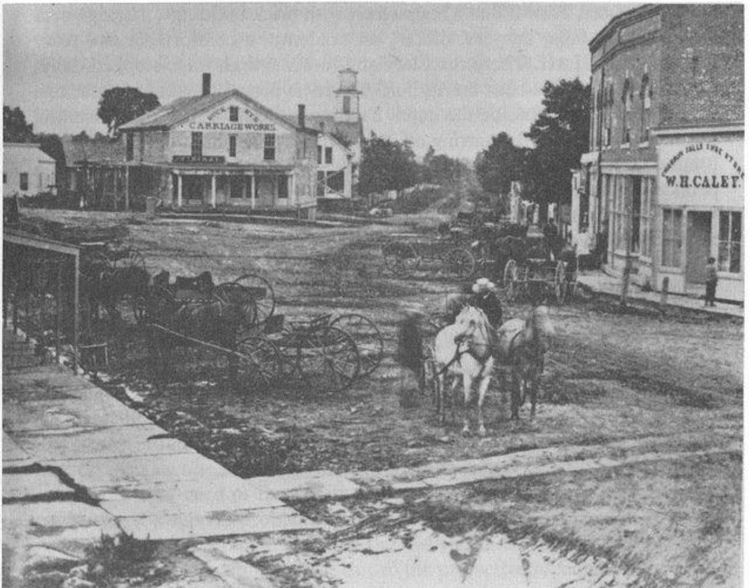
Buckeye Carriage Works building where Triangle Park is today (circa 1855)

Triangle Park has been a treasure for Chagrin Falls since 1875. Originally, this area of town was somewhat swampy and a creek ran through here that villagers used to wash their buggies and wagons. An ashery was built here, which was one of the first businesses in the community. The Buckeye Carriage Works building was then built where the park would ultimately exist. That building was moved back to 8 East Washington Street, just south of the current park. In 1873, the Village Council passed a resolution, presented by I. W. Pope to purchase the land to allow for widening of Franklin and Main streets and a park to be made. The low lying land was filled in and the creek was enclosed by a culvert that still exists today. A side walk was laid out around the outside and 21 maple trees were planted. A watering trough was installed at the north end and a fountain and pool were installed on the southern end that contained goldfish. The fountain was gravity fed from the creek.