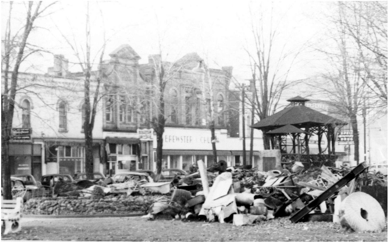
Triangle Park 1942 – Scrap dump-off for war effort