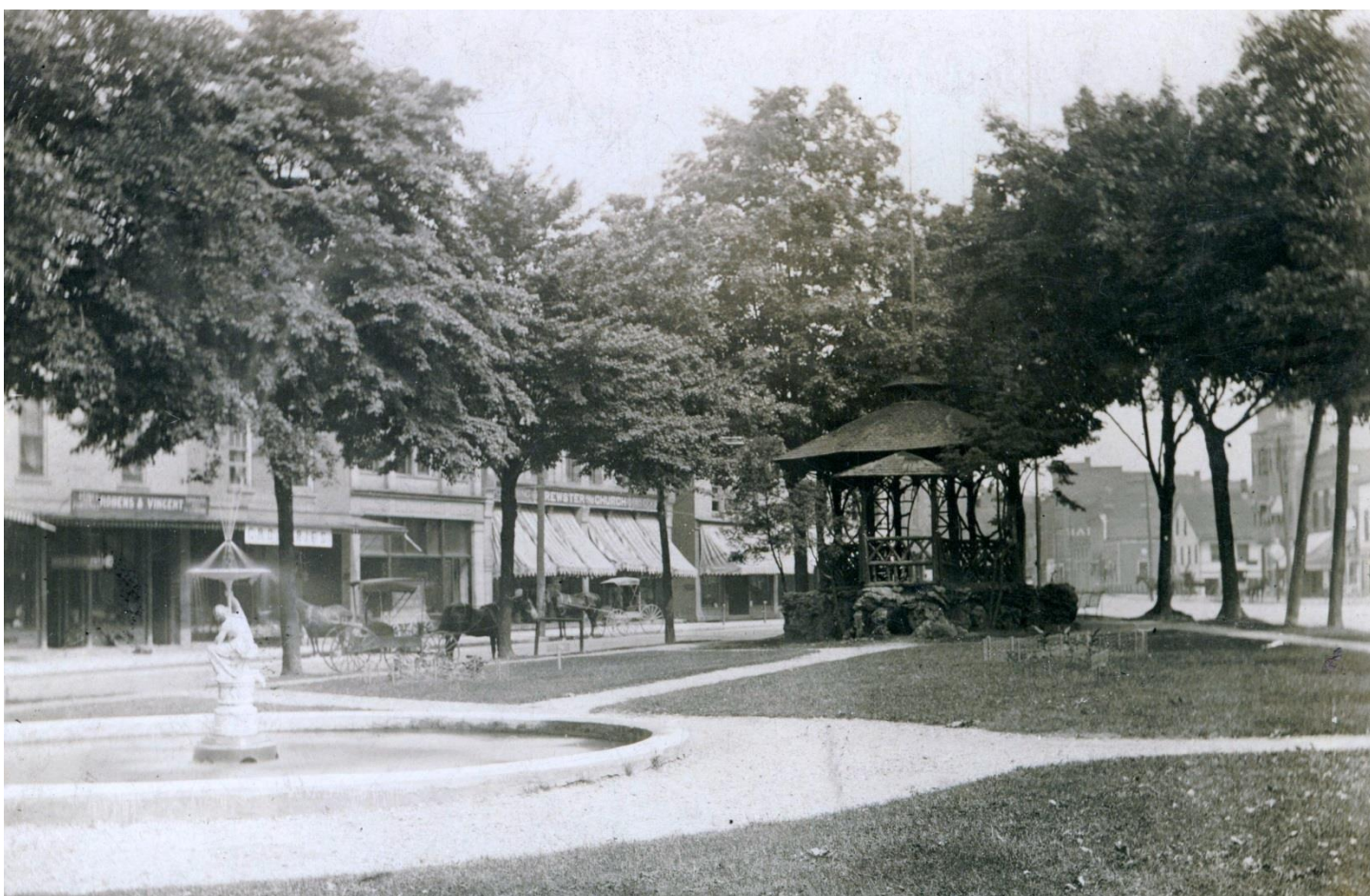
Triangle Park 1909