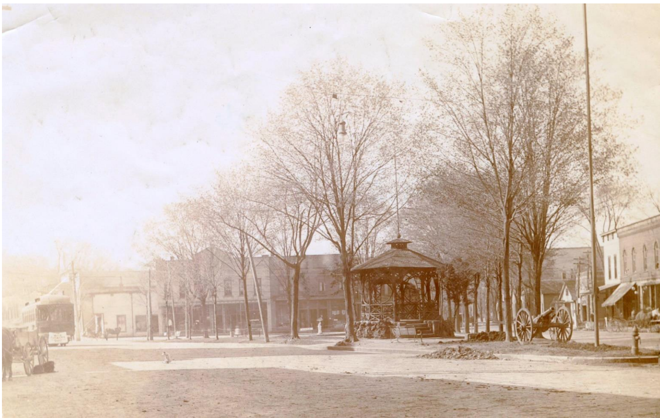
Triangle Park 1908