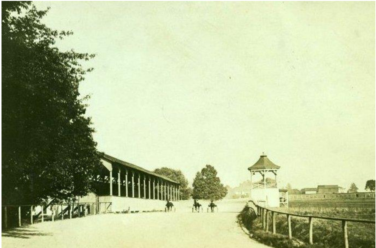
Harness Racers at the start of the race. The Grandstands are the older wooden stands that were replaced by the current structure in 1913.