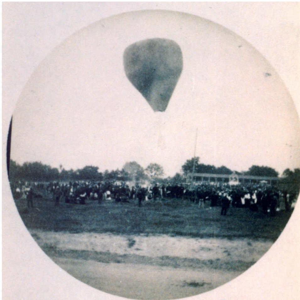
Even back in the day, Ballooning was popular