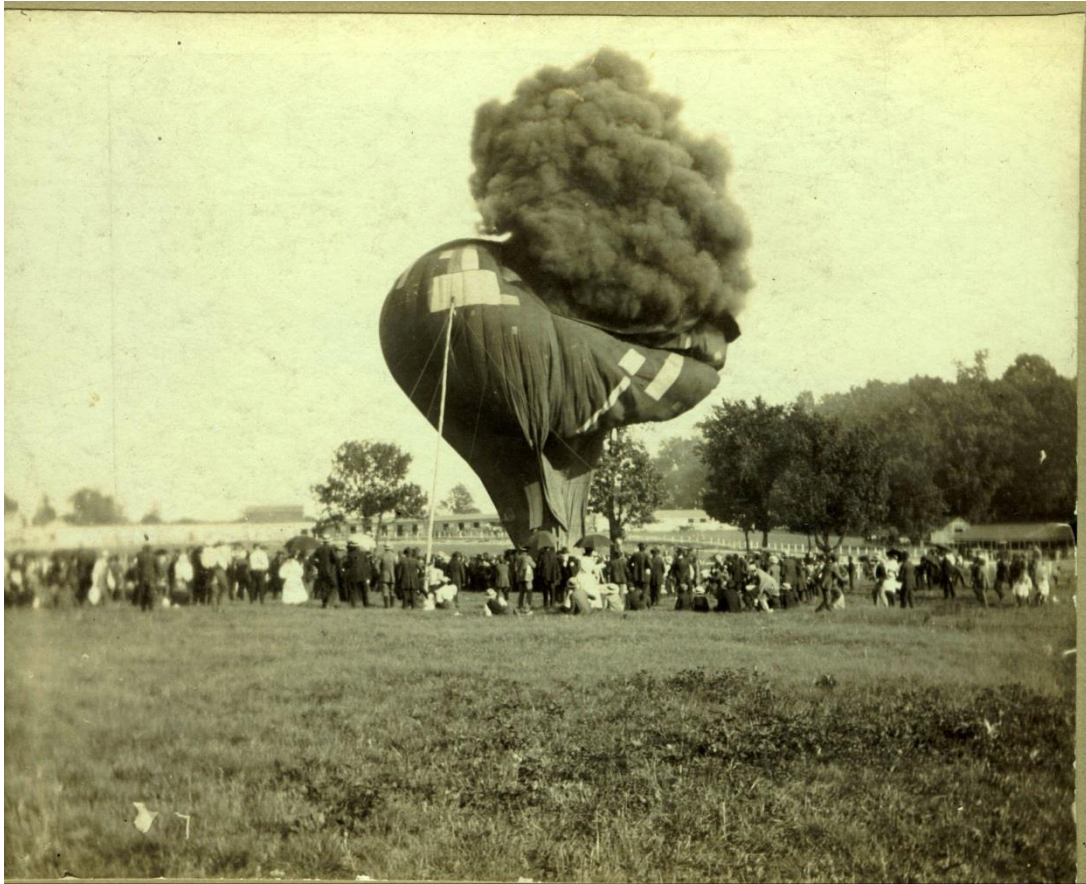
Not all balloon ascensions went smoothly