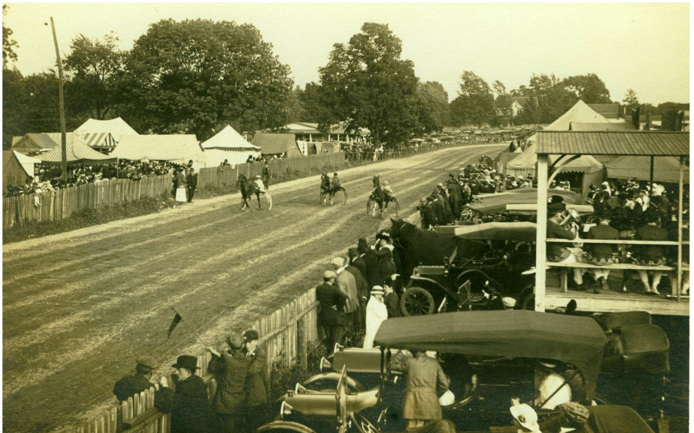
Harness Racers coming to the finish line.