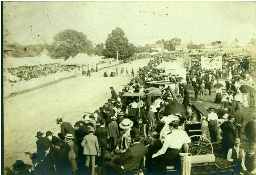
In between races