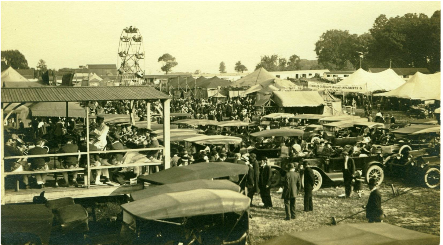
The Midway at the Fairgrounds