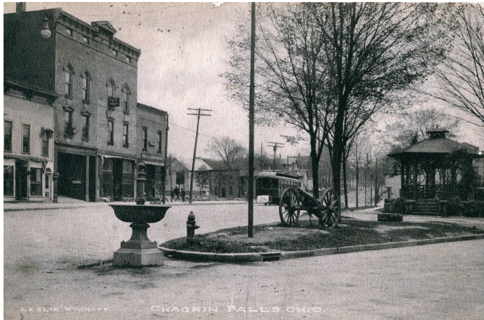
Cannon in 1911