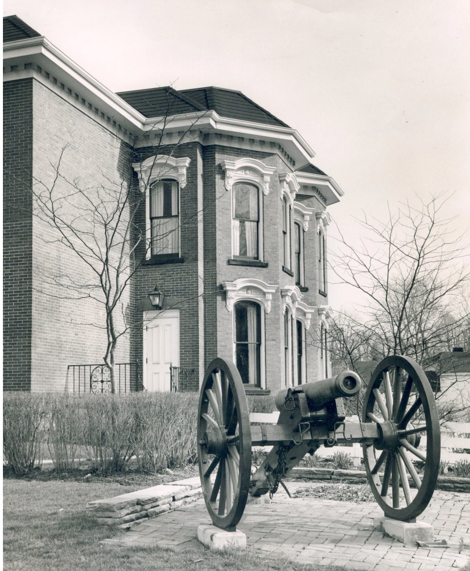
Cannon in front of Village Hall 1980