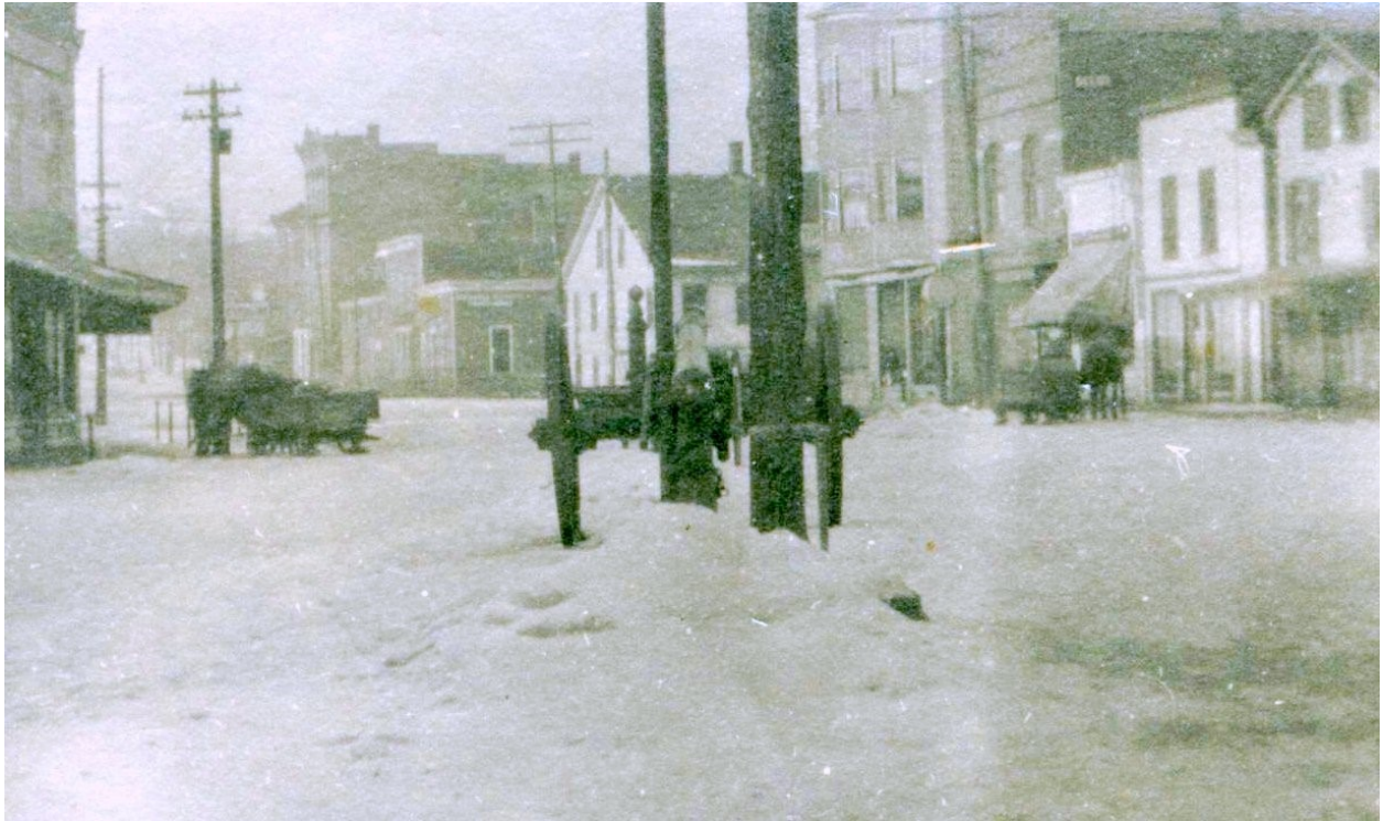
Cannon on north end of Triangle Park – 1891

In 1891, the cannon was placed in Triangle Park. No sooner had it been placed there, that the GAR had to ask the mayor's help in keeping boys from playing with it.