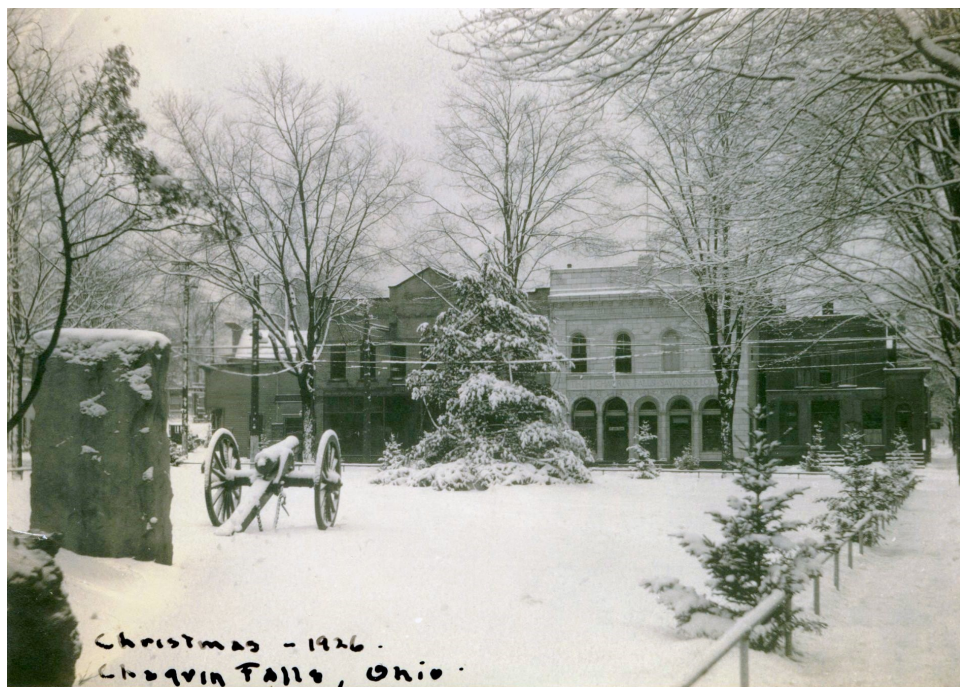
Cannon facing south on Triangle Park - 1926