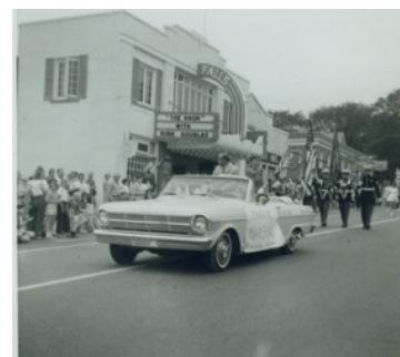
Tim Conway leading the 1963 Blossom Parade