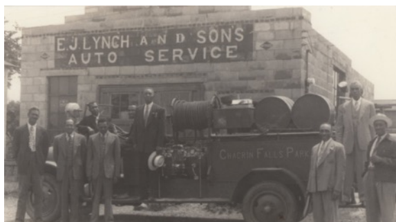
Chagrin Falls Park Fire Truck c. late 1940's