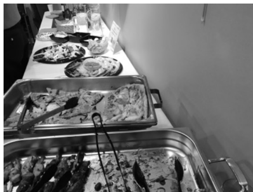
Delectable Goodies at the volunteer appreciation reception.