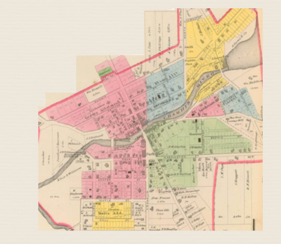
Chagrin Falls Historical Society Tours are sponsored by Safe Routes Chagrin